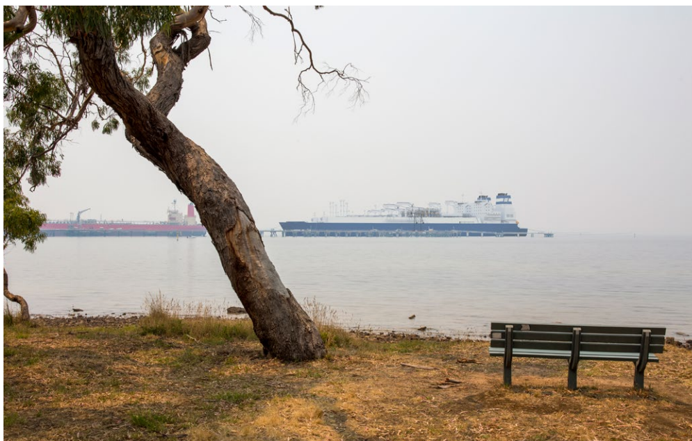
◀ Figure 14-10: Visualisation of the FSRU and LNG carrier from Woolleys Beach North facing east (United Petroleum carrier present on left). Note: haze in the image is due to smoke from bushfires in January 2020.