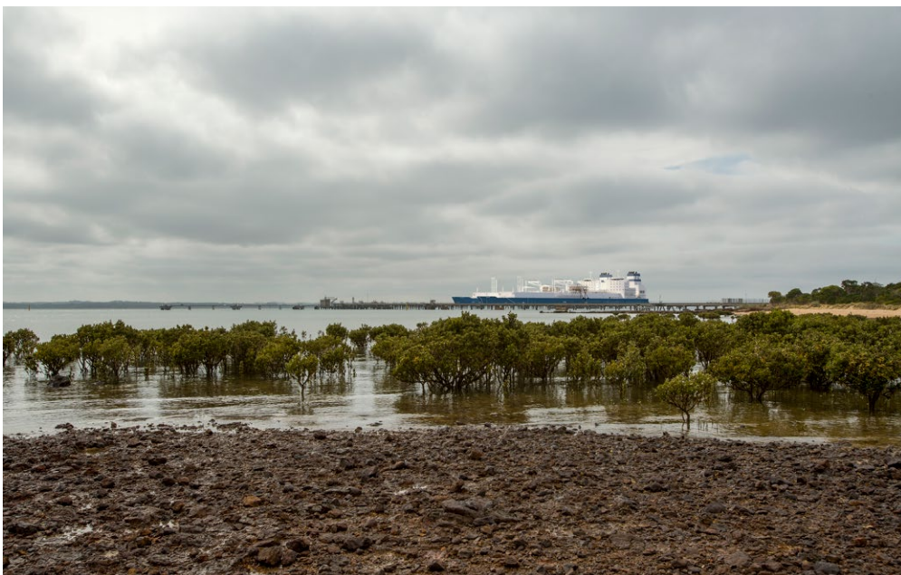
◀ Figure 14-9: Visualisation of the FSRU and LNG carrier from submarine lookout facing south-east

Appropriate materials and finishes would be applied to the Crib Point Receiving Facility, such as fencing design, architectural cladding, façade treatment (see mitigation measure MM-LV03) and screening vegetation incorporated into the site frontage at The Esplanade (see mitigation measure MM-LV02) providing it meets the bushfire safety management requirements. Additionally, exterior materials and finishes of the Crib Point Receiving Facility and the FSRU would be maintained to prevent aesthetic deterioration according to a schedule for cleaning, painting and general maintenance (see mitigation measure MM-LV04).