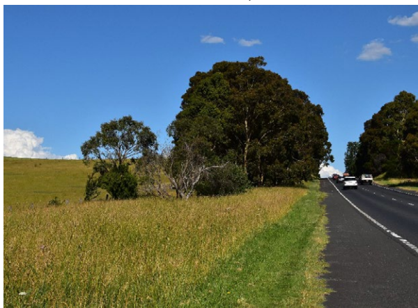
▼ Figure 14-6: Southern foothills landscape character area

Amenity impacts during construction have been minimised where possible through the optimisation of the pipeline alignment to determine the most efficient route with the least impact to the environment and community. Optimising the pipeline alignment allows for the retention of valuable vegetation and situates the works away from receptors.