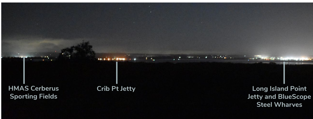
▼ Figure 14-3: Coastal foreshore light sources as viewed from French Island

The coastal foreshore character area is characterised by the generally well-vegetated foreshore interface with the large expanse of Western Port, along with the relatively undeveloped French Island. Combined, this makes for an environment of relatively low light levels at night time. The generally dark foreshore is interrupted by areas of concentrated lighting associated with existing port and maritime industrial activities. Major light sources in the vicinity are the Crib Point Recreation Reserve, the existing lighting on the Crib Point Jetty and onshore buildings, Hastings urban settlement, Hastings Reserve and the existing industry within the Port of Hastings (such as Long Island point Jetty and BlueScope Steel Wharves), as shown in Figure 14-3 .