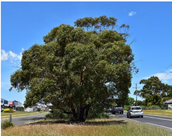
▼ Figure 14-4: Urban settlement landscape character area