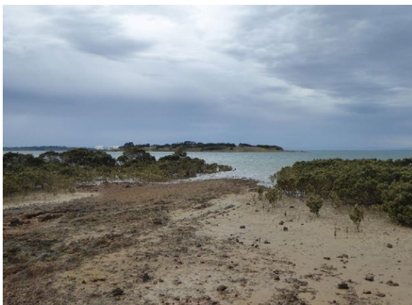
▼ Figure 14-2: Coastal foreshore landscape character area

Expansive open views are available across Western Port from within foreshore reserves, parks and trails including the Western Port Trail, which is a shared use path that follows the coastline from Somerville to Balnarring. These views are punctuated by boat masts and power poles and existing jetty/port infrastructure and are broken by low coastal scrub. Roadside views are narrow and linear, contained by thick roadside vegetation. Glimpsed views of Western Port are available from the roadside in very limited sections including at the entrance to Crib Point Jetty.