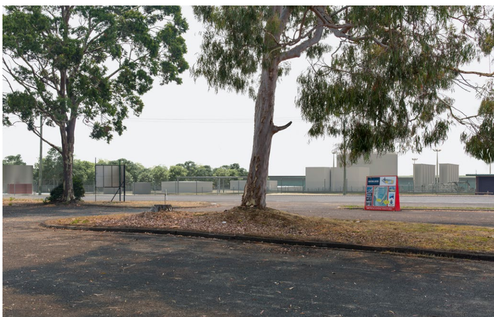
◀ Figure 14-11: Visualisation of Crib Point Receiving Facility from Victorian Maritime Centre