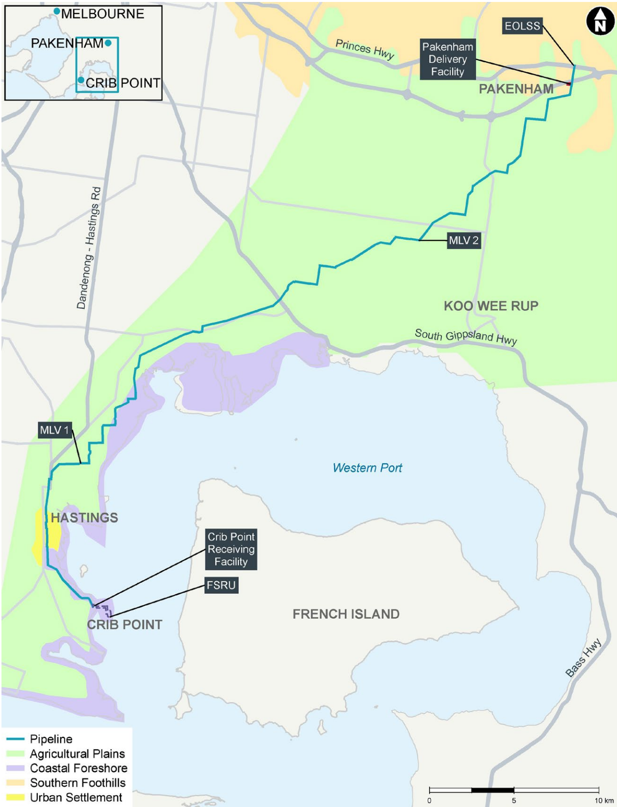
▲ Figure 14-1: Landscape and visual study area