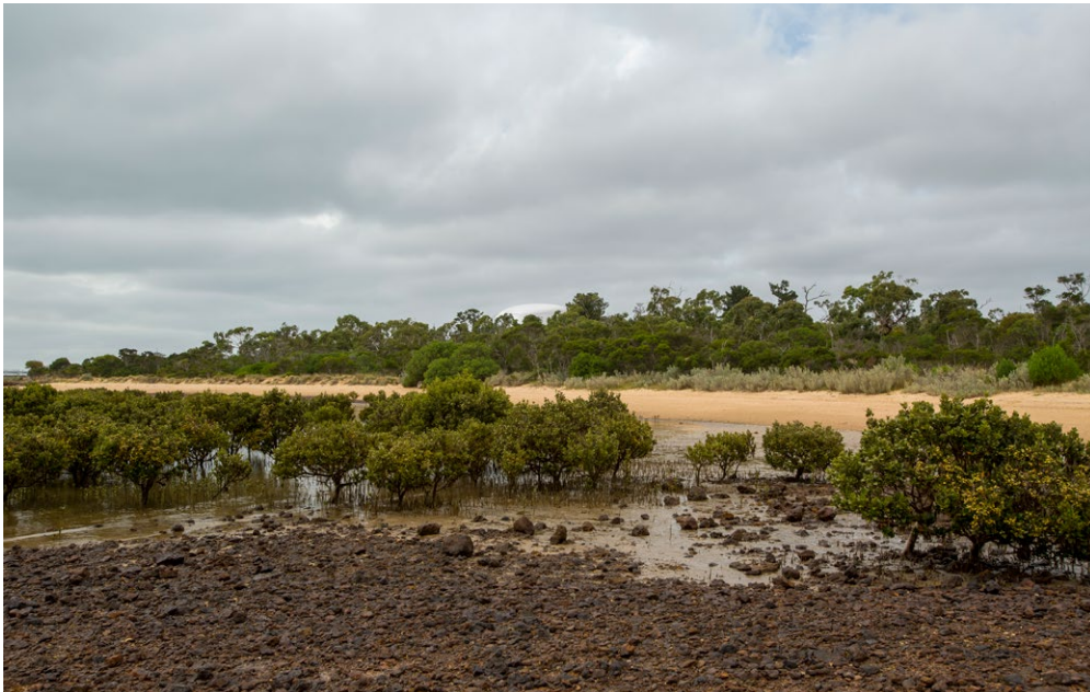
◀ Figure 14-8: Visualisation of the Crib Point Receiving Facility from submarine lookout facing south