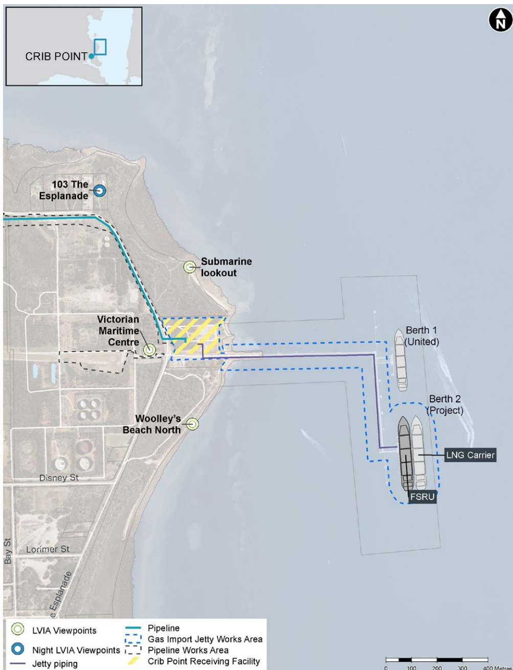
◀ Figure 14-7: Viewpoints at Crib Point

It is noted that while the significance of visual effects from these viewpoints is moderate, these effects are considered appropriate within the complementary context of the viewpoint, and the existing jetty and maritime industrial activities at the site. This significance rating (moderate) is largely a reflection of the impact on views across Western Port towards French Island consisting largely of flat foreground, sea and sky. The moderate rating was assigned considering a framed view of the Gas Import Jetty Works, without a petroleum tanker (that intermittently docks at Berth 1) or any other surrounding port or maritime activities.